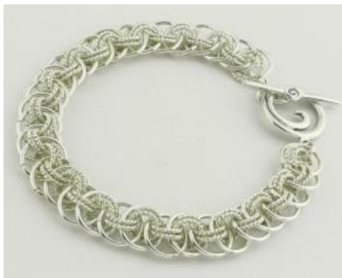
Argentium Sterling Kit $59