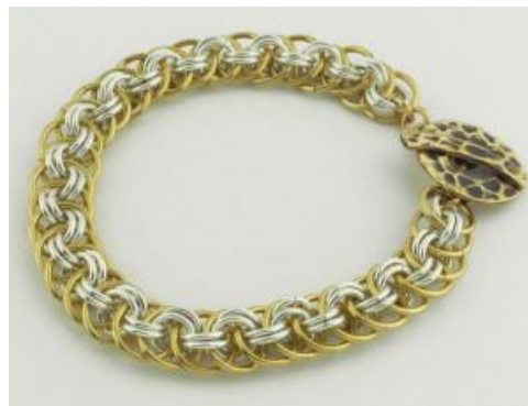
Bronze/Silver Filled Kit $24